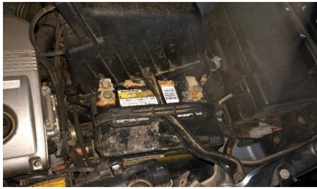
Heavily corroded battery with terminals still connected found in vehicle on Ro-Ro, taken in June 2020, provided by the Coast Guard.

Because the vessel had previously loaded vehicles in multiple ports across the country, it became evident that the hazardous conditions onboard this vessel were not limited to a single Captain of the Port (COTP) zone. Within three months of the aforementioned incident, a similar Ro-Ro vessel suffered a vehicle fire onboard while in the Sector Jacksonville's area of responsibility. Although this fire was not as severe as the incident in June of this year, it is likely due to the same contributing factors based on initial findings.