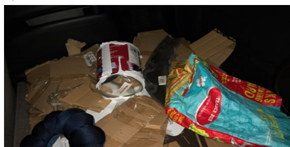
Paint and cardboard in a vehicle on deck 5 of cargo ship, taken in June 2020, provided by the Coast Guard.