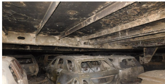
Cargo and structural fire damage on deck 8 of a cargo ship, taken in June 2020.