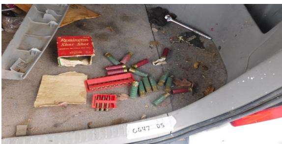
Ammunition found in trunk of vehicle from deck 5 of cargo ship, taken in June 2020, provided by the Coast Guard.

As the Coast Guard investigation began, several causal factors were identified. These causal factors included: vehicles leaking fluids, personal goods and combustibles stored within vehicles, and the failure to protect batteries from short circuiting. Coast Guard Investigators discovered numerous vehicles throughout the vessel not in compliance with the requirements onboard.