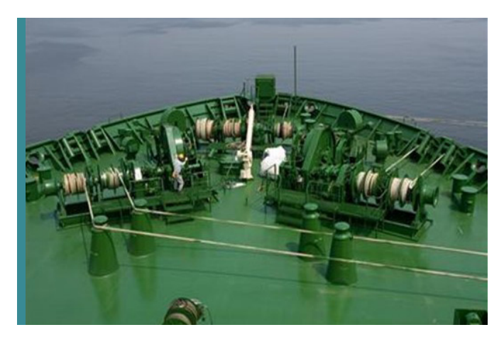
Common forms of damage to be checked for on mooring lines and wires include:

Any damaged, defective or otherwise unserviceable piece of mooring equipment found should be taken out of service immediately until either proper repairs can be conducted or the defective item is replaced.