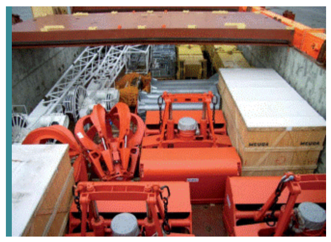
Loading break bulk cargo

Vessels which have not been specifically designed for the carriage of breakbulk cargoes may not be fitted with sufficient lashing points for the securing of these cargoes. If this is the case then additional lashing points may need to be fitted. Proper consideration should be given to the location of additional lashing points in order to avoid incorrect positioning and potential damage to the vessel's structure. If required, Class or third party consultants may be able to provide additional guidance on positioning and fitting.