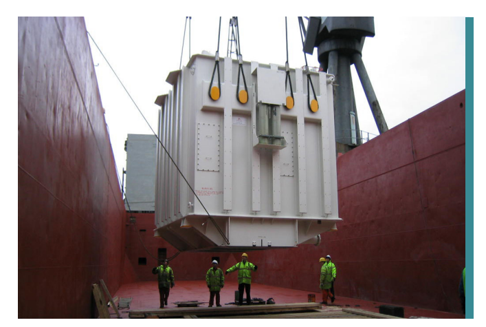
Example of project cargo

While the loading, stowage and securing of these cargoes can be approached in a similar fashion, some have unique considerations to be taken into account during the planning stage, some of which are included below.