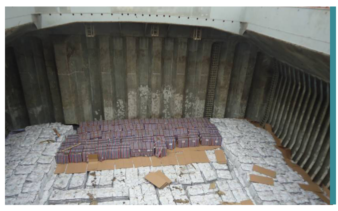
Cargo in jumbo bags

If cargo is permitted to be loaded on top of the bags, then it is likely that the bags will move or settle throughout the voyage resulting in lashings slackening and with the potential risk of the stow collapsing. The construction of the bags will determine the maximum compressive load and as a result the maximum height to which the bags can be stacked. This is normally a maximum of three tiers high.