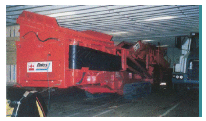
Tracked vehicle secured on deck

While the above highlights some of the more common types of breakbulk cargoes where incidents have occurred it is by no means exhaustive. It is important when planning the loading of any breakbulk cargo that the hazards and risks presented by the particular cargo are assessed fully.