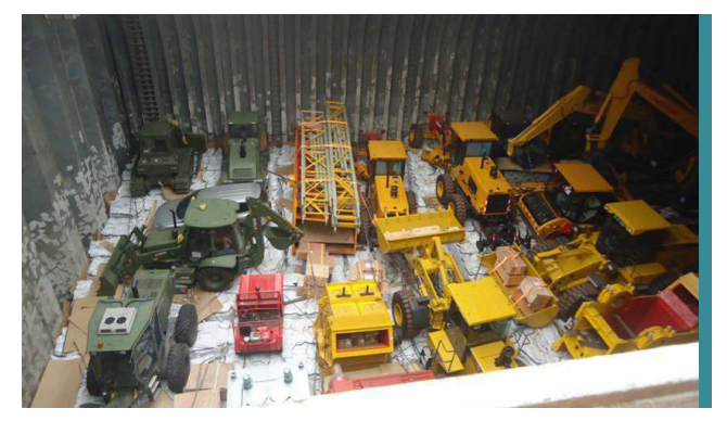
Example of poor loading practices with vehicles loaded over jumbo bags