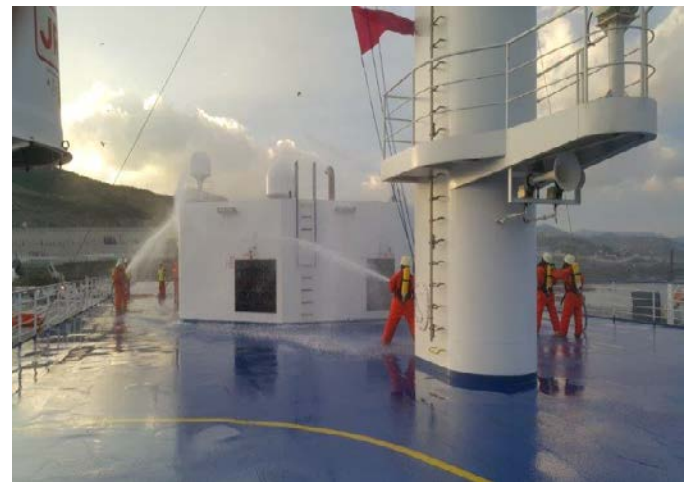
Fig 6: Fire drill - boundary cooling

Bulkhead and deck temperatures should be monitored and boundary cooling should be maintained until such time as there is a notable decrease in temperatures. Regular checks should also be carried out after this to monitor for any potential re-ignition.