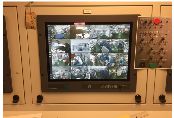
Fig 4: CCTV remote monitoring

Activation of numerous detectors heads, unexplained electrical faults or a smell of smoke in the accommodation should be enough to convince the OOW that a problem may exist that warrants the vessel's emergency response plans to be initiated. If in doubt – act.