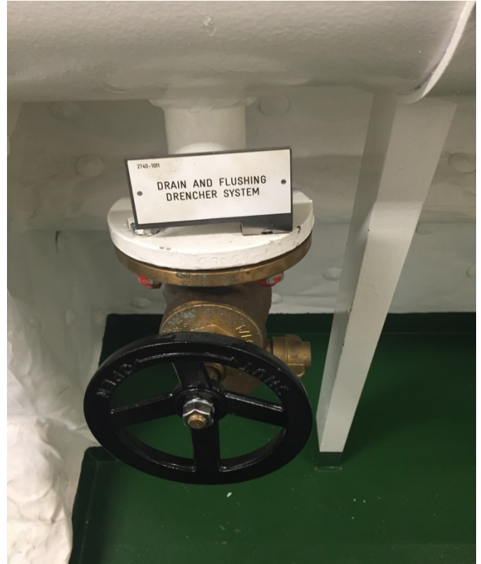
Fig 7: Drenching system flushing valve

After the initial fire there may be a great deal of damage to both the ship structure and cargo units. There may also be flammable fluids, electrical connections and other sources of ignition present along with fuel that may have leaked from tanks. Therefore the chances of a secondary fire occurring is significantly higher.