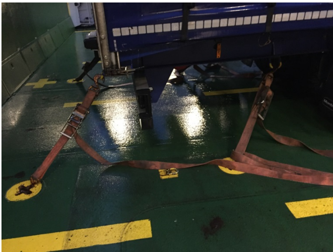
Fig 2: Lashing should be suitable for vehicle type and weight

Vehicles should, so far as possible, be aligned in a fore and aft direction. They should not be parked on permanent walkways or in such a way as to obstruct fire-fighting equipment or scuppers.