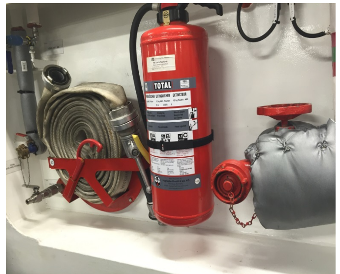
Fig 13: Portable fire-fighting equipment

In order to be best prepared for any emergency situation it is important that crew members are fully aware of the location and use of all critical safety equipment on board the vessel.