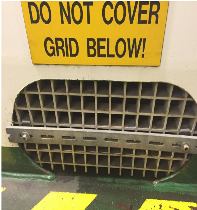
Fig 8: Vehicle deck drain

If the vessel's water drenching system is activated, a close check must be made on the over side discharge and the angle of list of the vessel. If a noticeable decline in the amount of water being discharged through the overboard drains is noticed in combination with the listing of the vessel then consideration should be given to stopping the drenching system until the vessel is brought upright.