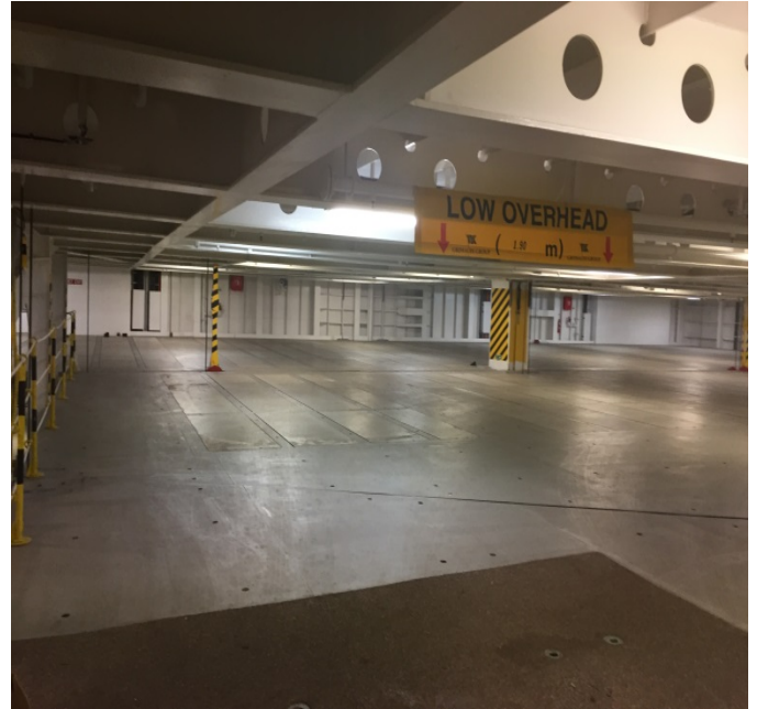
Fig 9: Clear deck

Ensure vehicle decks are free from clutter or items that may block drainage system if a drenching system is activated. If movable screens are fitted then check regularly that they are all in place and that they are fit for purpose i.e. to prevent drains being blocked by floating debris.