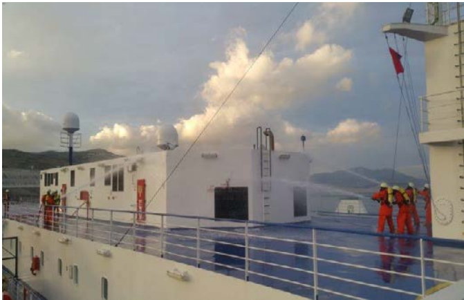
Fig 14: Fire drill - boundary cooling

The importance of boundary cooling cannot be ignored and in order for boundary cooling to be effective, the crew must fully understand the layout of the vessel and where boundary cooling should be applied to prevent the fire spreading to adjoining spaces.