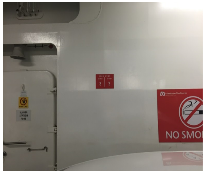
Fig 10: Car deck one separation with no smoking signs

Smoking and naked flames should not be permitted on any vehicle decks. Conspicuous "no smoking" or "no smoking/naked lights" signs should be displayed.