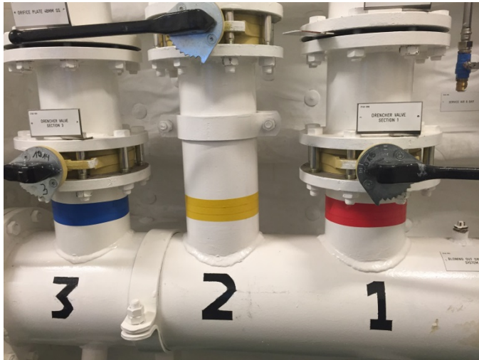
Fig 11: Drencher system valve labelling (colour coded)

The crew should also be familiar with the operation of the fixed fire-fighting system. The time to find out how the system is operated correctly is not in an emergency situation.