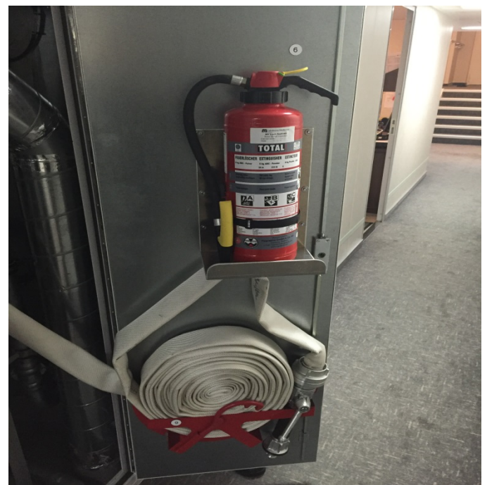
Fig 15: Planned maintenance should include both fixed and portable equipment