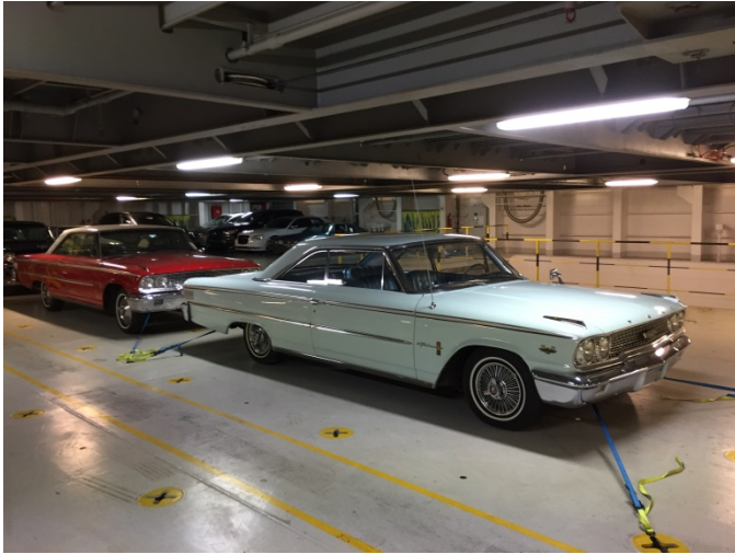
Fig 1: Vehicles securely lashed