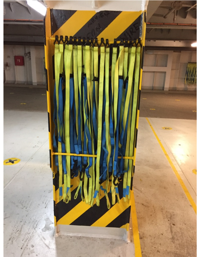
Fig 3: Well maintained and organised lashing equipment

If there is doubt any doubt as to the suitability of the parking brake then the vehicle should be secured with the assumption that the parking brake may fail or not engaged fully.