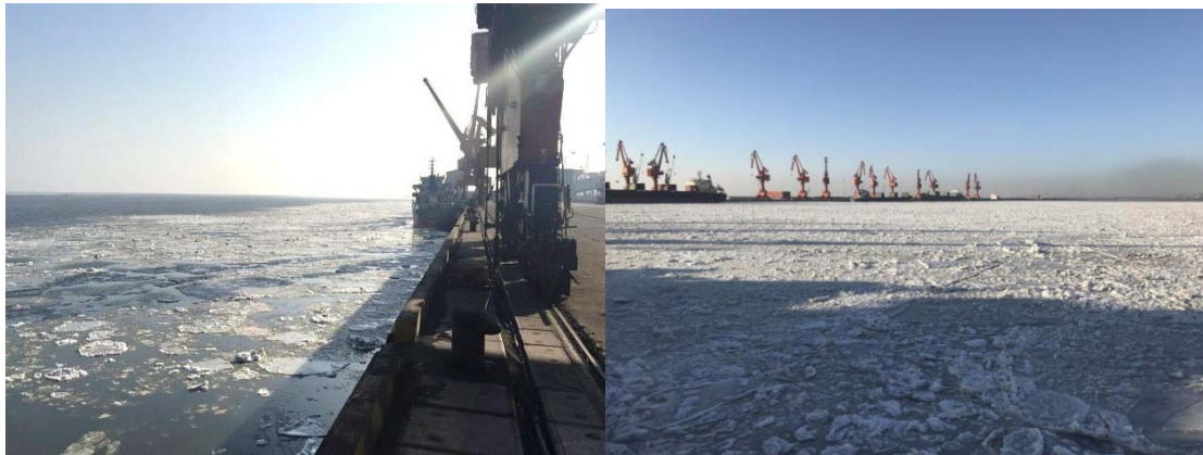
(Photos taken at Dalian port: floating ice are observed at harbor basin, channel and anchorage)

Operations at these ports are in normal condition. There is no ice breaker at North Liaodong Bay, and big tugs are used to break big pieces of ice in the harbor basin near by the shore as well as around the channel to ensure safe navigation.