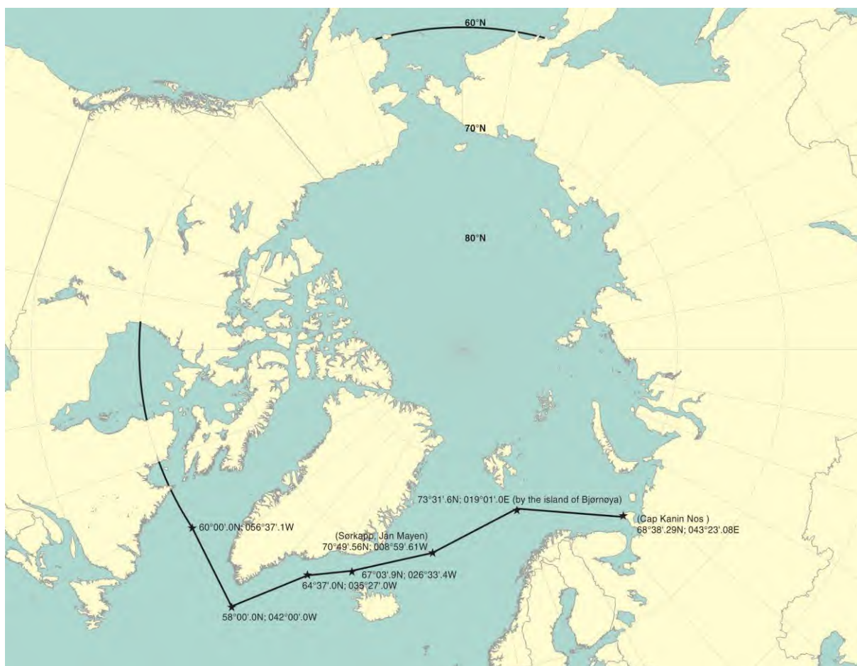
Figure 2 – Maximum extent of Arctic waters application 3