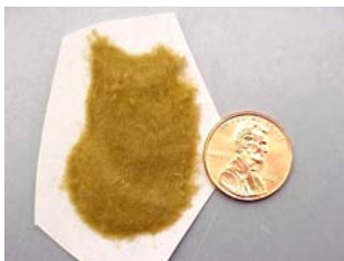
Gypsy Moth egg mass next to penny