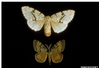
Adult Female (top) and Male (bottom)