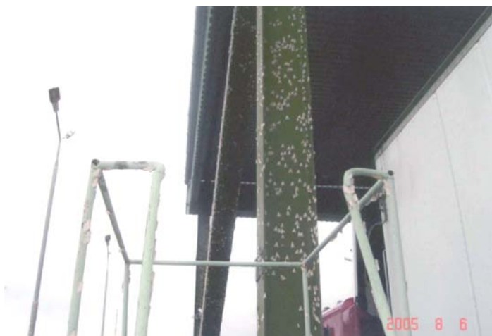
A vessel covered with egg-laying Gypsy Moths in a Russian Port

Knife, paint scraper, or putty knife - to scrape the eggs from the structure.