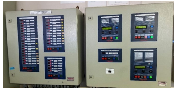
Fixed gas detection panel

One critical safety measure on liquefied gas carriers is the fixed gas detection system. If gas vapors are detected in a monitored space, an alarm will activate and alert the crew of the dangerous condition. The International Code for the Construction and Equipment of Ships Carrying Liquefied Gases in Bulk (IGC Code) requires the activation of alarms at specified vapor concentrations. However, during exams on three separate Liquefied Natural Gas (LNG) carriers in Boston, Port State Control Officers (PSCOs) discovered issues with the fixed flammable gas detection system that resulted in the issuance of deficiencies and delay of cargo operations. While witnessing tests, multiple sensors measured outside the tolerances established by the manufacturer and subsequent calibration checks failed. In each case, crewmembers were not following established procedures as specified in their Safety Management System (SMS).