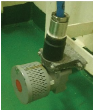
Electronic sensor sample point

Testing procedures and allowable tolerances should be understood by the crewmembers responsible for maintaining and testing the fixed gas detection system. Although the examined gas carriers' SMSs and manufacturers' instructions specified procedures for testing the fixed gas detection systems and stated the acceptable parameters for the sensors, many of the sensor tests observed by the PSCOs had readings outside of the established tolerances. In these types of situations, a "drifting sensor" often causes detectors to exceed tolerances specified by the manufacturer. Sensors operating outside of established tolerances pose a significant safety threat and could be grounds for vessel control actions, such as delayed departure from port, delayed cargo operations, or detention.