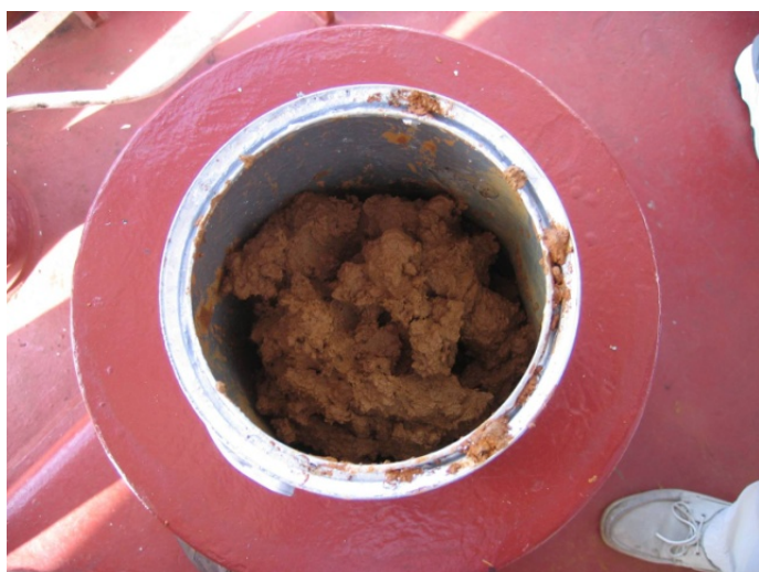
Figure 1 - Solid state – before a 'can' test – particles held together by friction

In its solid state the particles of the material are held together by friction and the cargo has the characteristic of a solid. Cargo on loading appears 'normal' – like slightly damp sand (see Figure 1). However, if there is sufficient moisture in the cargo, external agitation can increase the pore water pressure to the 'flow moisture point' (FMP), where water pushes the particles apart. The material then undergoes a sudden transition to the flow state where it loses the friction between particles. The cargo begins to behave like a liquid (see Figure 2).