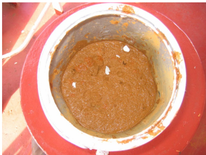
Figure 2 - Liquid state – after a 'can' test - no friction between particles

The 'flow moisture point' (FMP) of any cargo that may liquefy is absolutely critical – even the slightest excess of moisture above the FMP could lead to liquefaction.