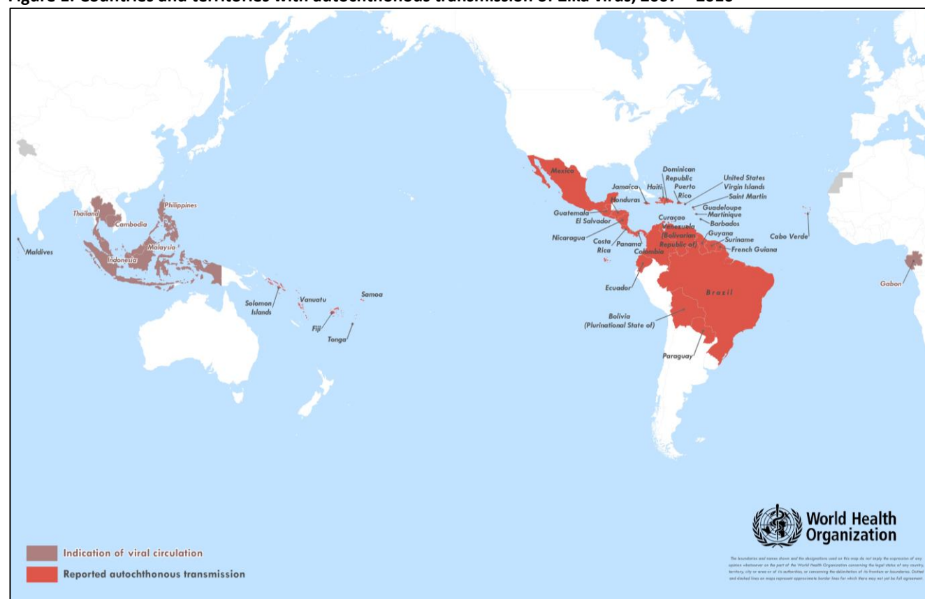
Figure 1: Countries and territories with autochthonous transmission of Zika virus, 2007 – 2016

The boundaries and names shown and the designations used on this map do not imply the expression of any opinion whatsoever on the part of the World Health Organization concerning the legal status of any country, territory, city or area or of its authorities, or concerning the delimitation of its frontiers or boundaries. Dotted and dashed lines on maps represent approximate border lines for which there may not yet be full agreement. Data as of 5 February 2016.